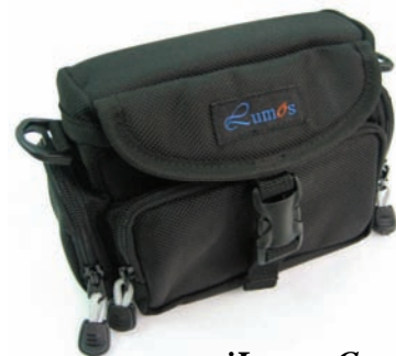
iLoupe Carrying Case

Aven Inc 4595 Platt Road Ann Arbor, MI 48108 Tel: 734-973-0099 Fax: 734-973-0097