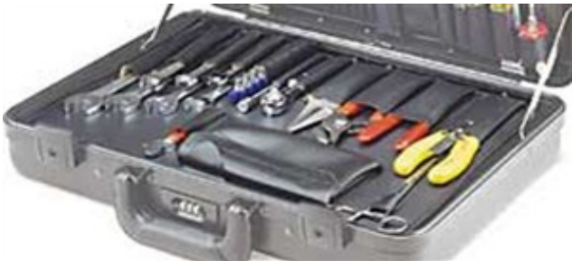
Pallet = 216-322