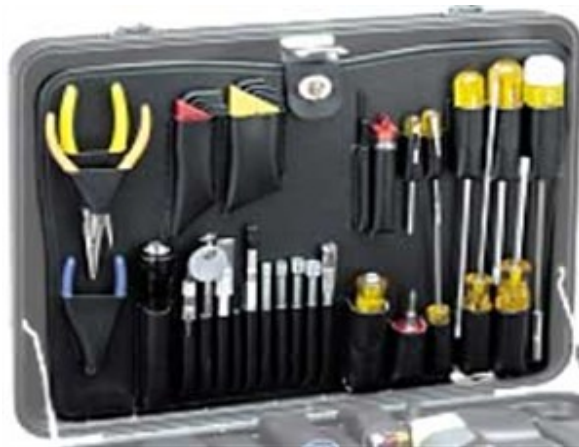
Pallet = 23-800