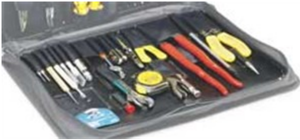
Pallet = 23-805