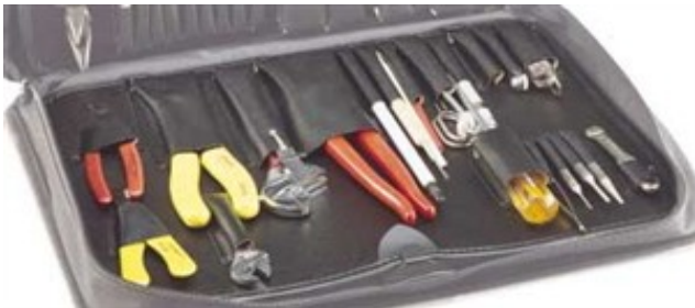
Pallet = 23-402